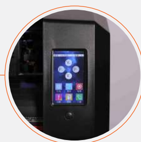
4.3 inch touch screen