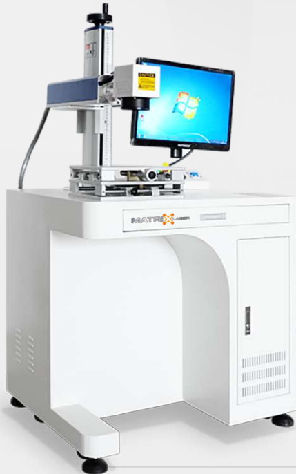
Fiber Laser Marking Machine

*Specifications are subject to change without prior notice, all rights reserved.