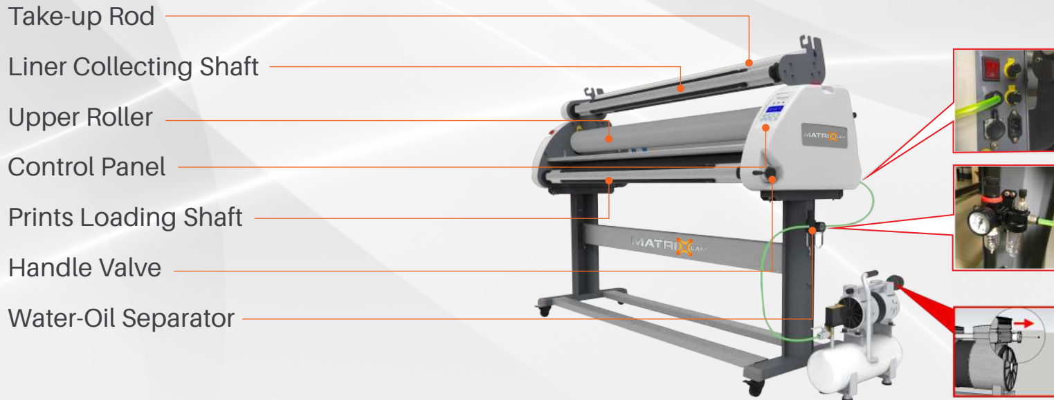
DIAGRAM OF WHOLE MACHINE