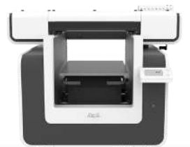
UV Printing Machine NC-UL600

Digital Star Qatar has been leading the digital scene in Doha for over 10 years, as suppliers and distributors of signage, advertising and LED solutions. Our commitment to providing the best quality machinery and top-notch technology from around the world has enabled us to set new and improved standards in sign and digital printing industries. DSQ has developed into a true trendsetter and a reliable destination for customers seeking exhaustive custom and wholesale solutions. From sign makers, digital print houses, POS/POP makers, retail fit-out companies, to exhibition stand builders, construction companies and glass and aluminum fabricators industries, we promise to take your business to unprecedented levels