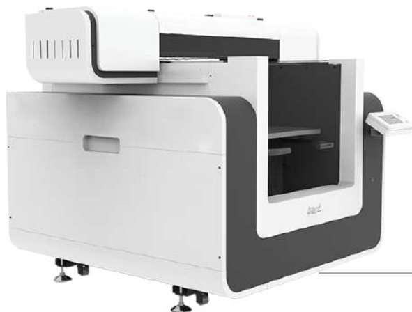
NC-UL600 UV Printing Machine