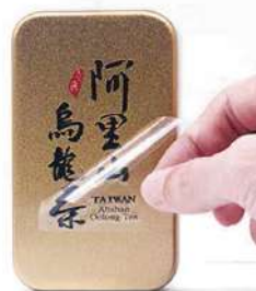
Peel off the transparent covering film