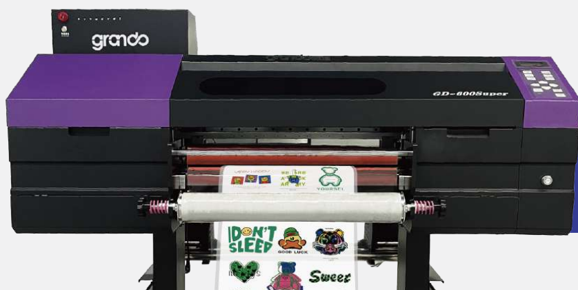
GD600Super UV Crystal Label Printer