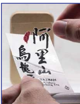
Cut one piece of the transfer sticker