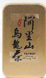
Stick to the object surface