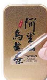
Peel off the transparent covering film