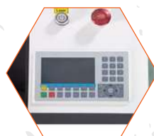
RD Control Panel