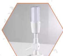
Machine Running Indicator