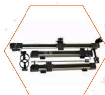
High-Precision Slider Group