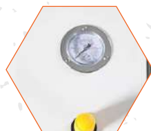
Air Pressure Controller