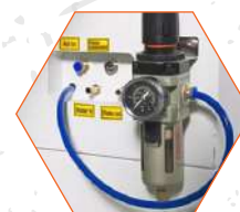
Oil Water Separator