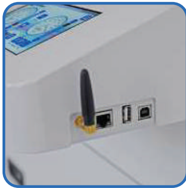
MULTIPLE CONNECTION METHODS