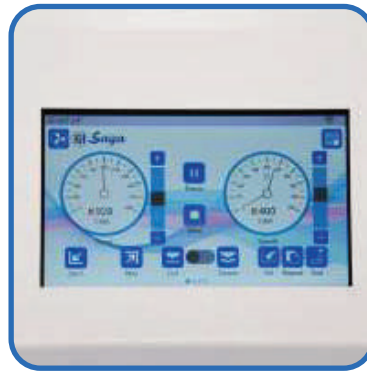
7-INCH FULL TOUCH SCREEN