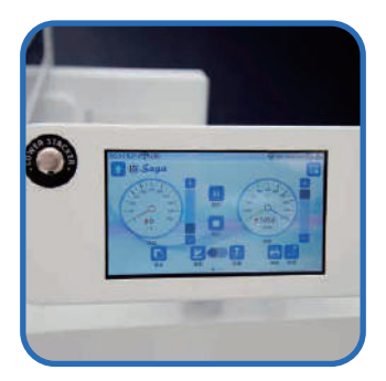
7 INCH FULL TOUCH SCREEN