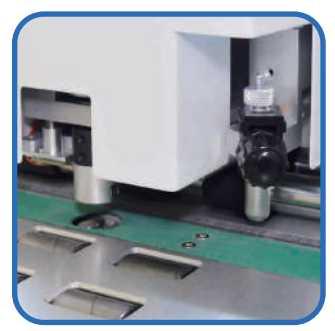
DOUBLE KNIFE DESIGN