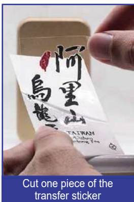
Cut one piece of the transfer sticker