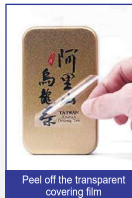
Peel off the transparent covering film