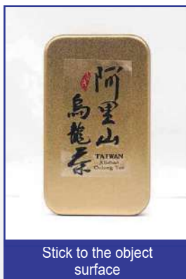
Stick to the object surface