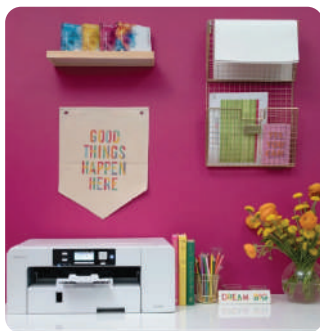
No Bulky Systems

VersiFlex is the all-in-one desktop solution that delivers DTF-style quality without the big investment. Create proven best-sellers like cotton tees, mugs, and wood signs all with one powerful, easy-to-use desktop system that fits your space, budget and business goals.