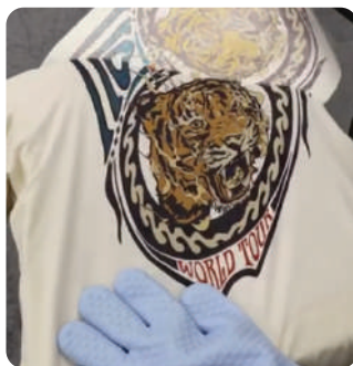
No Fussy Mess