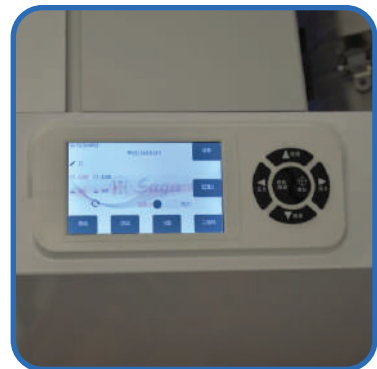
4.3" TOUCH SCREEN