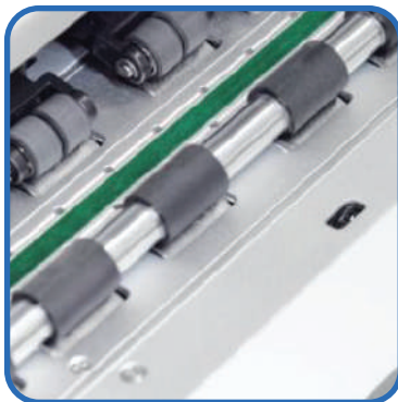
DOUBLE ROW PAPER WHEEL